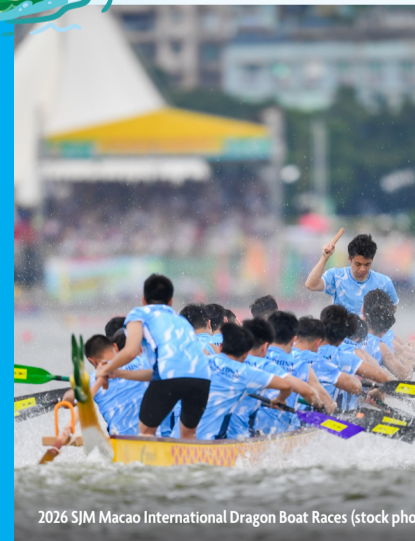
2026 SJM Macao International Dragon Boat Races (stock photo)

KONG SENG TICKETING SERVICE Macao (853) 2855 5555 Hong Kong (852) 2380 5083 Mainland China (86) 139 269 1111 Booking online www.macauticket.com