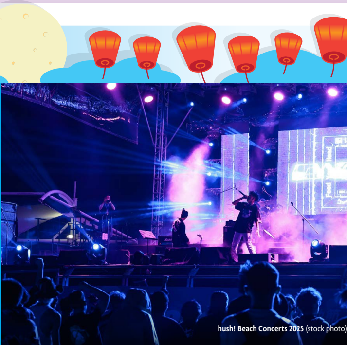
hush! Beach Concerts 2025 (stock photo)

fragrant mooncakes, and a festive spirit that coincides perfectly with the final night of the fireworks contest. Expect an unforgettable crescendo. For music lovers, the hush! Beach Concerts 2025 (Oct 18 th -19 th ) bring a laid-back, sunny vibe to Macao's shores, showcasing live acts and a festival atmosphere. Sports fans, meanwhile, are in for a treat as NBA royalty arrives in town for the NBA China Games 2025 (Oct 10 th -12 th ), bringing elite basketball action to the city. With its rich blend of festivities, performances, and high-energy events, Macao is definitely the place to be this October.