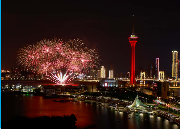
33 rd Macao International Fireworks Display Contest (stock photo)

KONG SENG TICKETING SERVICE Macao (853) 2855 5555 Hong Kong (852) 2380 5083 Mainland China (86) 139 269 1111 Booking online www.macauticket.com